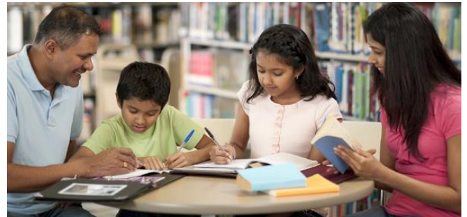
Parent Involvement Matters

Your child is learning about accepting and respecting differences in individuals. Learning how to develop healthy relationships is an important part of your child's development. Relationships right now mean everything to your child. Talk to them about what a good friend might act like. Ask them how it feels to be friends with someone who is a good friend to them? As a parent, what do you do when your child comes home and tells you about someone at school who was not being a good friend to them or someone else? Use the opportunity to talk about what it means to be a good friend, and why someone might not be a good friend.